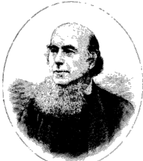
Pastor Charles Chiniquy 1809-1899