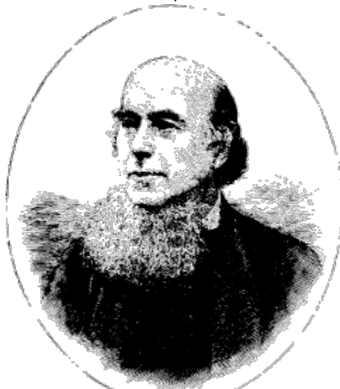
Pastor Charles Chiniquy 1809-1899

When the hour of my deliverance came, the Lord took me by the hand and helped me to cross the Red Sea. He brought me to the Land of Promise a land of peace, life, and joy which passeth all understanding.