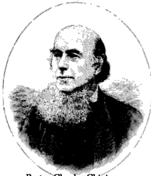
Pastor Charles Chiniquy 1809-1899