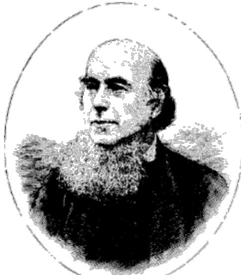
Pastor Charles Chiniquy 1809-1899